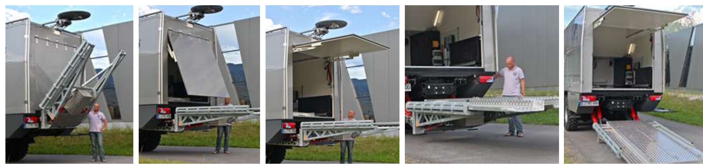
ACTION MOBIL Lifting- and loading system for heavy loads