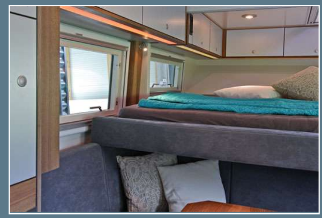
At the touch of a button, the bed, which is normally retracted to save space, can be converted into a spacious lounger. Thus the entire length of the vehicle is kept compact, generating space for bulky objects in the rear garage.