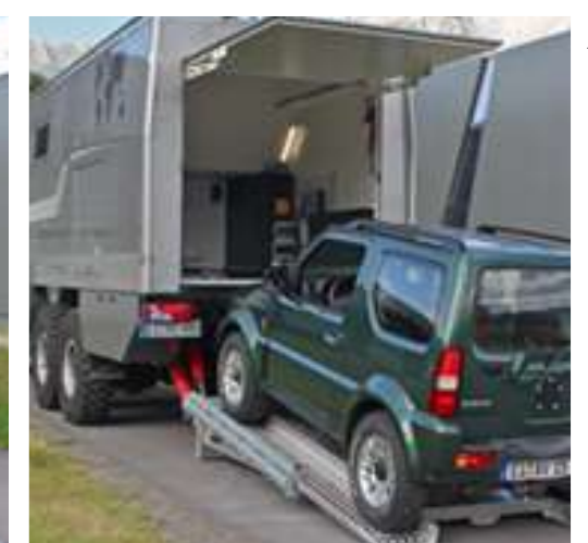
ACTION MOBIL Lifting- and loading system for heavy loads