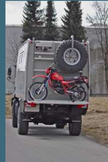
Light-weight and stable: The electrically driven lift of stainless steel made by ACTION MOBIL for motorbike and spare wheel.