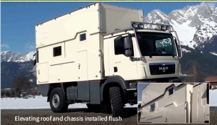
Elevating roof and chassis installed flush

“LIVING instead of “CAMPING” What more luxury could you wish for?